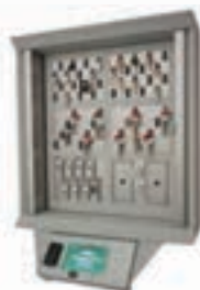
Key access locker systems