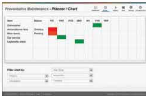
Calendar and maintenance planner