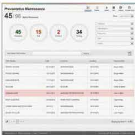
Complete listing of all items